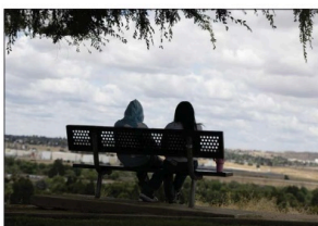
Two people enjoy the weather at the Panorama Bluffs on a nice Friday in late May.

"But what happens for us is that ... we will basically get a push of marine air into Central California. And of course, the marine air is much cooler and