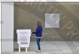
A woman drops off her ballot at a drop box outside the Kern County Administrative Building on Friday.