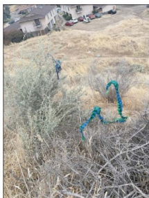
A Highland High graduation ribbon lies strewn near the site of a motorcycle crash Thursday afternoon near Panorama Drive and Union Avenue in northeast Bakersfield.